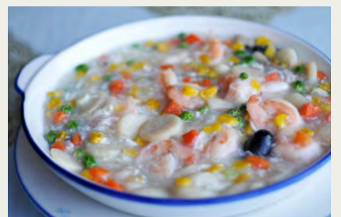
蝦龍糊 $14.98 Jumbo Shrimp with Lobster Sauce