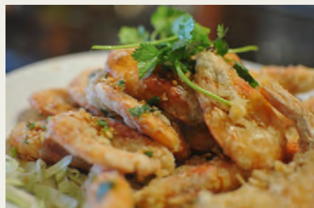
椒鹽有頭蝦 $14.98 Salt & Pepper Shrimp with Heads