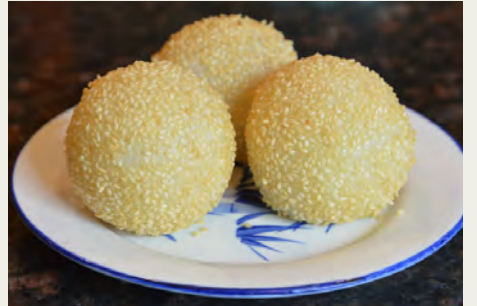
豆沙煎推子 Fried Sesame Ball with Red Bean Paste (3)