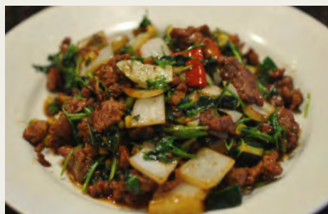
小炒牛肉 House Stir Fry Beef (Spicy/not) $12.98 小炒羊肉 House Stir Fry Lamb (Spicy/not) $15.98