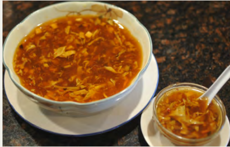
川味酸辣湯 Hot & Sour Soup