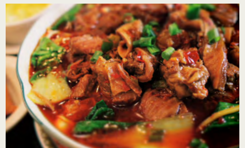
牛腩麵 Beef Stew Noodle Soup $10.98