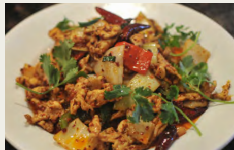
川香烤雞 🌶️ Szechwan BBQ Chicken $11.98 川香烤牛 🌶️ Szechwan BBQ Beef $12.98 川香烤羊 🌶️ Szechwan BBQ Lamb $15.98