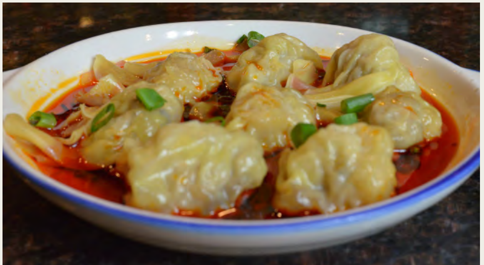
紅油抄手 Steamed Shrimp & Pork Wonton with Red Chili Sauce (8)