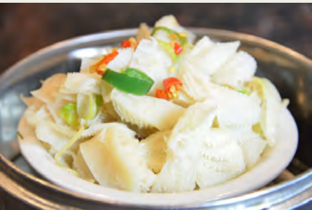
薑蔥牛百葉 Ginger Steamed Beef Tripe