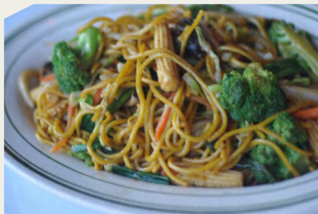
素菜粗炒麵 Vegetable Lo Mein $8.98