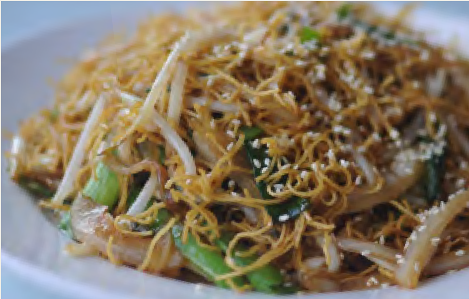
鼓油皇炒麵 Hong Kong Noodle $10.98