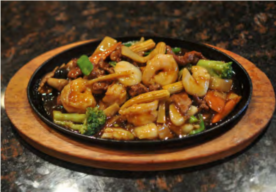
鐵板帶子牛蝦 Jumbo Shrimp, Scallop, Beef & Vegetable on Hot Plate $16.98