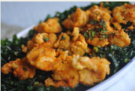
泰式咖哩蝦球 Thai Curry Shrimp $15.98 泰式咖哩魷魚 Thai Curry Calamari $15.98