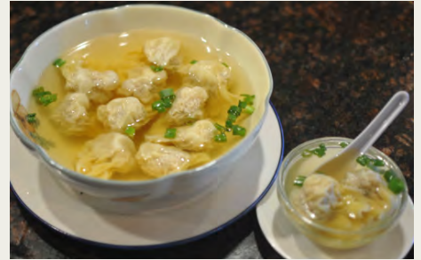
鮮蝦餛飩湯 Pork & Shrimp Won Ton Soup