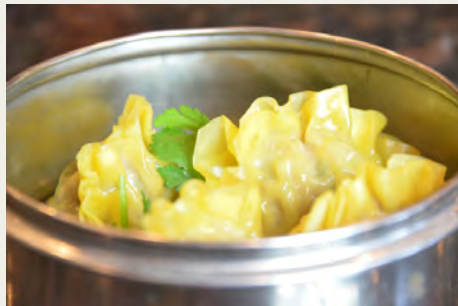
魚翅餃 Imitation Shark Fin Dumplings (4)