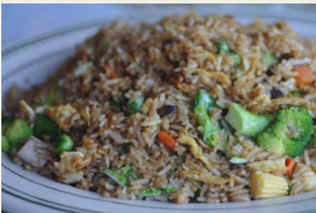
蔬菜炒飯 Vegetable Fried Rice $8.98