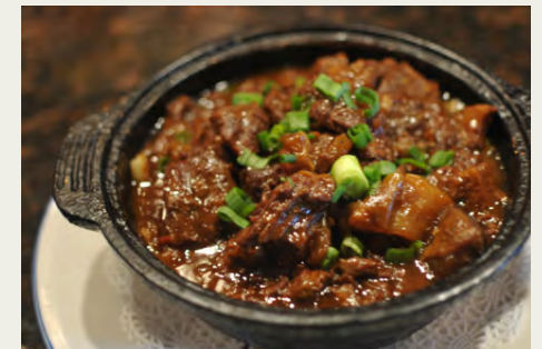
時菜牛腩煲 Beef Stew in Hot Pot $13.98