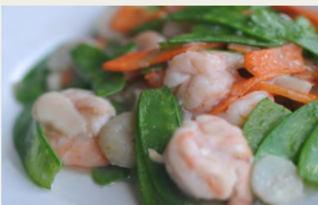
雪豆蝦球 Jumbo Shrimp with Snow Peas $14.98 蔬菜蝦球 Jumbo Shrimp with Vegetable $14.98