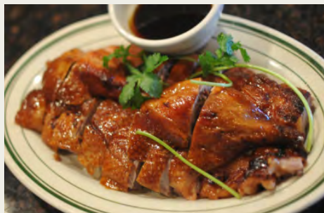
明爐火鴨(全) Roasted Duck (Whole) $21.98 明爐火鴨(半) Roasted Duck (Half) $13.98