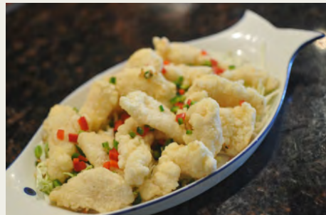
椒鹽魚片 Salt & Pepper Sole Fish Filet