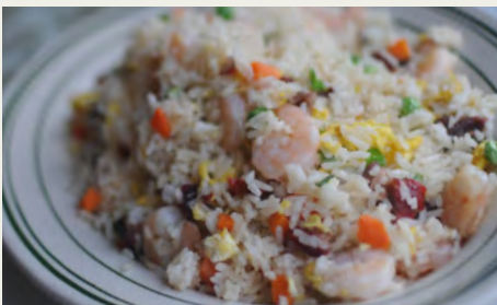
揚州炒飯 Yangzhou Fried Rice $11.98