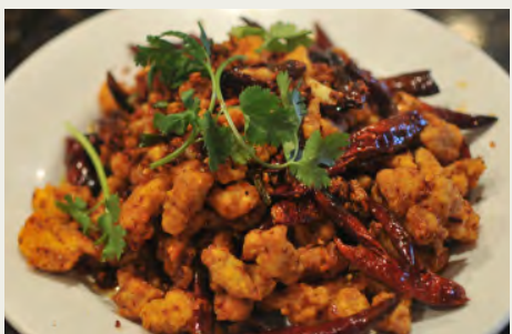
香辣雞丁 🌶️ Hot Pepper Chicken $11.98 水煮牛肉 🌶️ Szechuan Style Boiling Beef $13.98