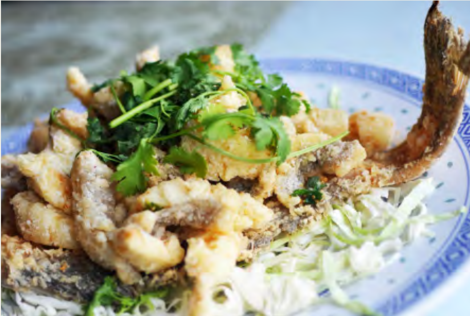
椒鹽龍俐球 Salt & Pepper Whole Sole Fish (Flounder)