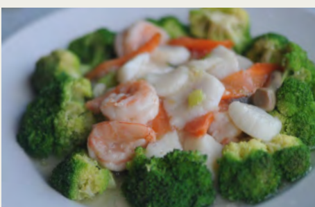
碧綠帶子蝦 $16.98 Scallops and Shrimp with Vegetables