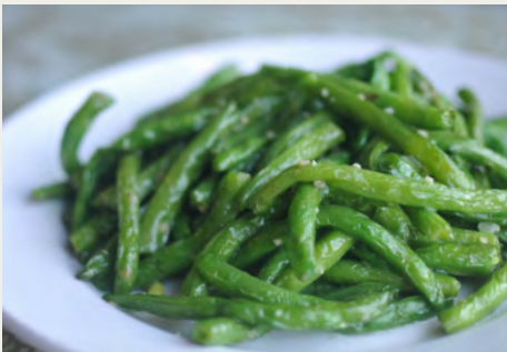
蒜蓉四季豆 Green Bean with Garlic $9.98