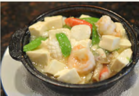
海鮮豆腐煲 Seafood & Tofu in Hot Pot $14.98