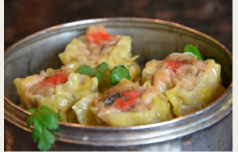
北菇蒸燒賣 Steamed Pork Shu Mai (4)