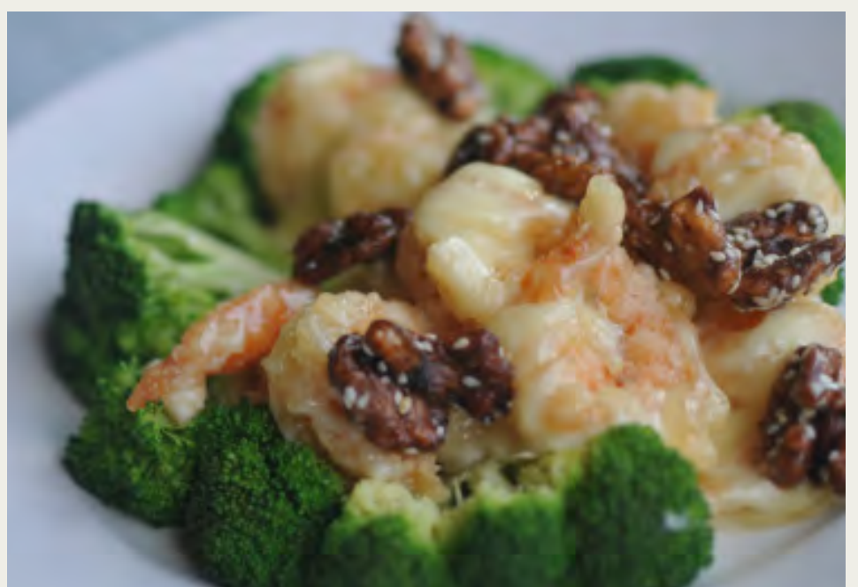
沙律核桃蝦球 Jumbo Shrimp with House Special Walnuts $15.98 芝麻大蝦 Jumbo Shrimp with Sesame Sauce $14.98 甜酸大蝦 Sweet & Sour Jumbo Shrimp $14.98

BANQUET, MEETING ROOM, CARRY OUT, CATERING