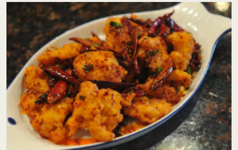
香辣魚片 Hot Pepper Sole Fish Filet