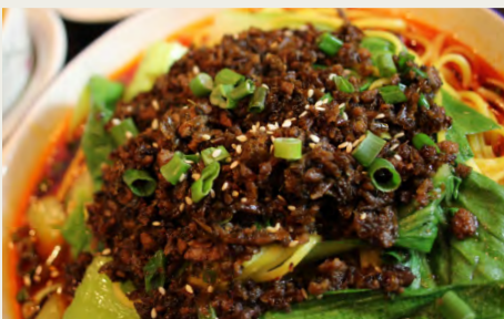
紅油擔擔麵 Szechwan Dan Dan Noodle $10.98