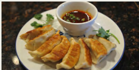
鍋貼 Pork and Vegetable Potstickers (8)