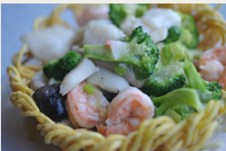
雀巢三鮮 $16.98 Shrimp, Calamari & Scallop in Bird Nest