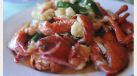
龍蝦(薑蔥/豆豉/椒鹽/香辣) MP Lobster Tail (Ginger and Scallion/S&P/Black Bean Sauce)