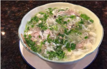
西湖牛肉羹 Shredded Beef Porridge