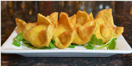
蟹角 Fried Crab Rangoon (6)