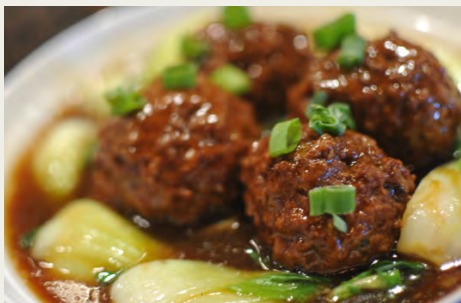
紅燒獅子頭 Shanghai Meat Ball $12.98