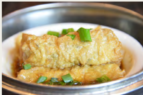
蠔油鮮竹卷 Deep Fried Beancurd Skin Roll with Oyster Sauce