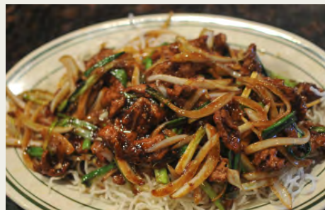
蔥爆牛肉 Mongolian Beef with Scallies $12.98 蔥爆羊肉 Mongolian Lamb with Scallies $15.98