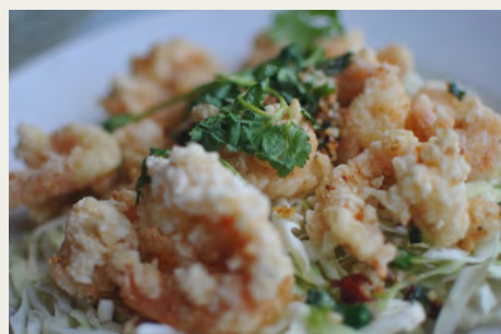
椒鹽蝦球 Salt & Pepper Shrimp $14.98