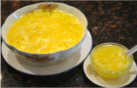
清爽蛋花湯 Egg Drop Soup