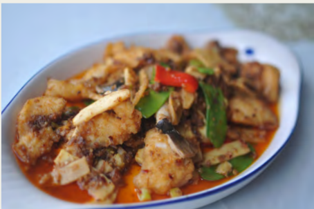
XO醬魚片 Sole Fish Filet with XO Sauce