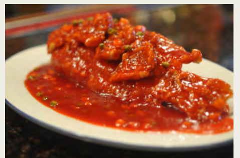
脆皮全立魚 Crispy Whole Tilapia Fish with Chef Sauce