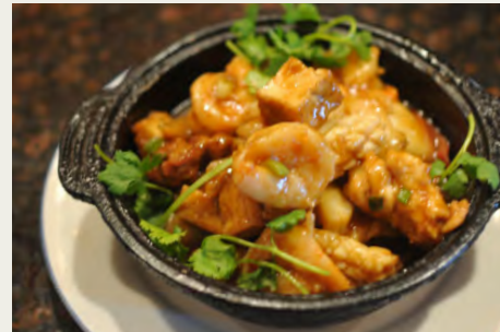
八珍豆腐煲 Eight Treasures Tofu in Hot Pot $14.98