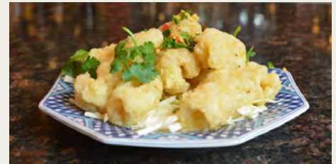
椒鹽魷魚 Salt and Pepper Calamari