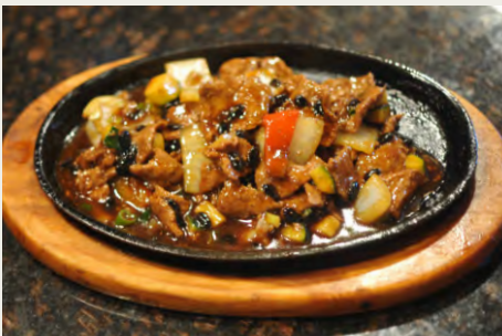
鐵板豆豉牛肉 Beef with Black Bean Sauce on Hot Plate $13.98