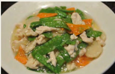
雪豆雞 / 牛 Chicken/Beef with Snow Peas $11.98/$12.98 蔬菜雞 / 牛 Chicken/Beef with Vegetable $11.98/$12.98