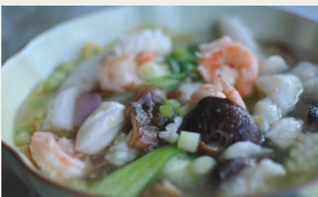
冬菇海鮮湯米(麵) Seafood Noodle Soup $11.98