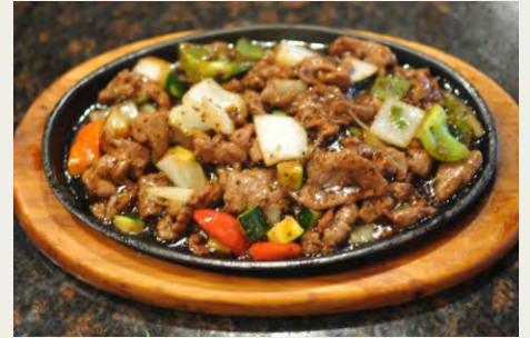
鐵板黑椒牛肉 Black Pepper Beef on Hot Plate $13.98