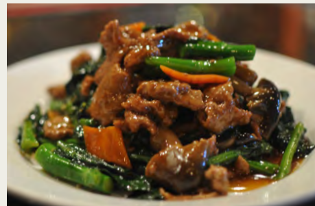
中國芥蘭牛肉 Beef with Chinese Broccoli $12.98 西蘭花炒牛肉 Beef with Broccoli $12.98