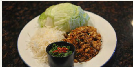
雞粒生菜包 Lettuce Wraps with Chicken