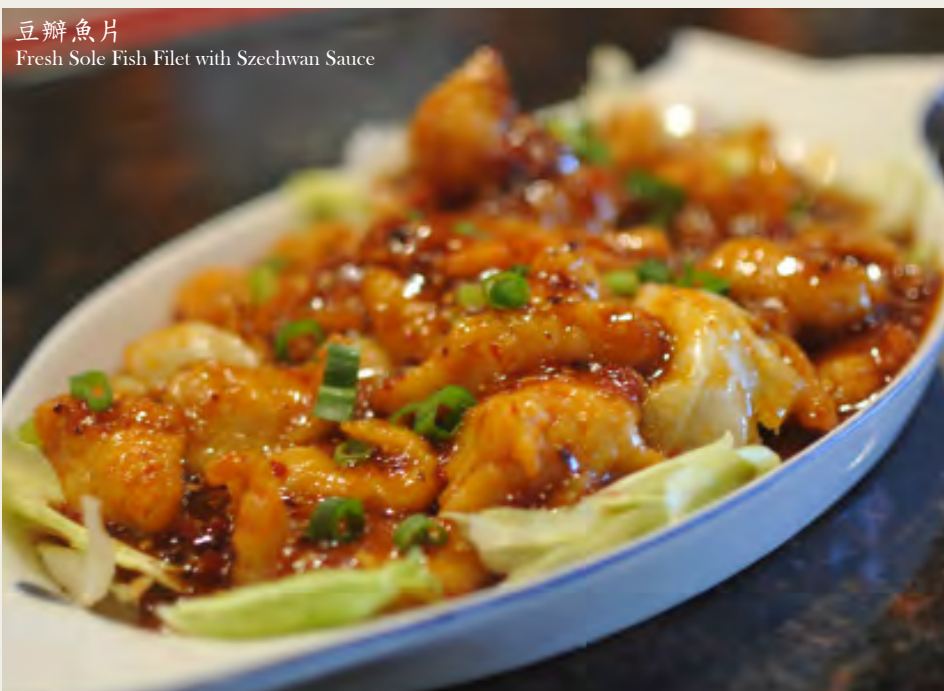
豆瓣魚片 Fresh Sole Fish Filet with Szechwan Sauce