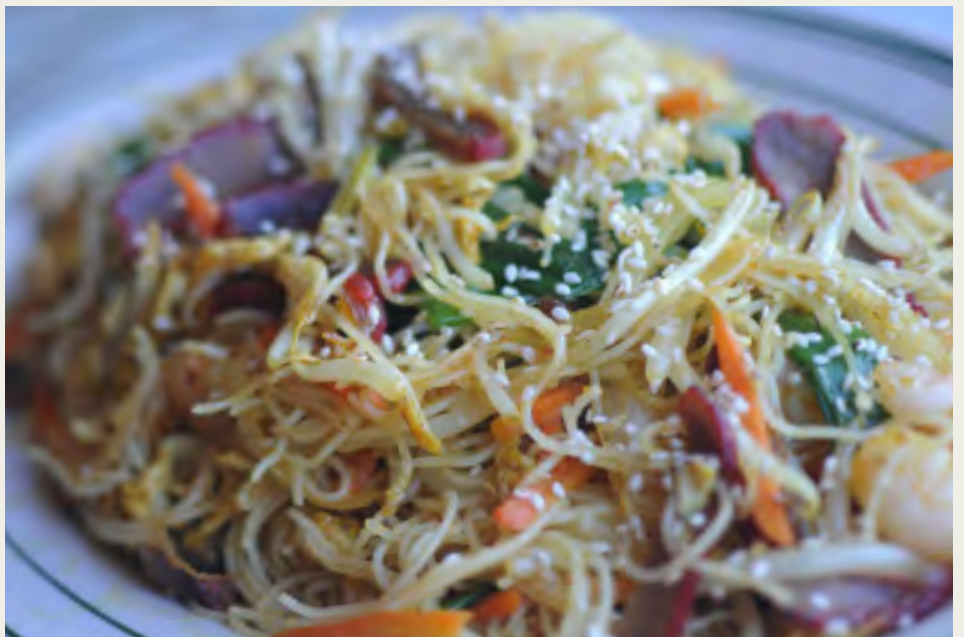
星洲炒米粉 Singapore Rice Noodle $11.98