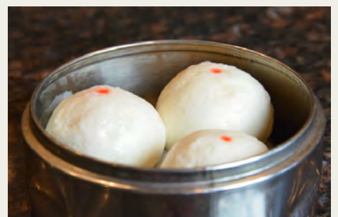
奶皇包 Steamed Egg Custard Bun (3)