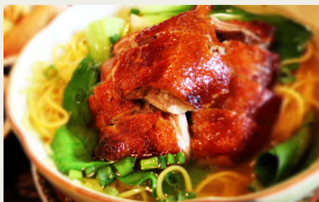
火鴨湯麵(粉) Roasted Duck Noodle Soup $10.98