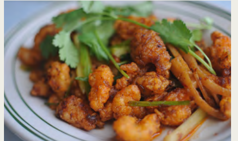
海鮮小炒皇 $16.98 Jumbo Shrimp, Calamari & Scallop Chef Style