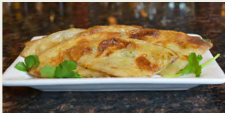
蔥油餅 Scallion Pancake