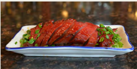
蜜汁叉燒 Honey Grilled BBQ Pork