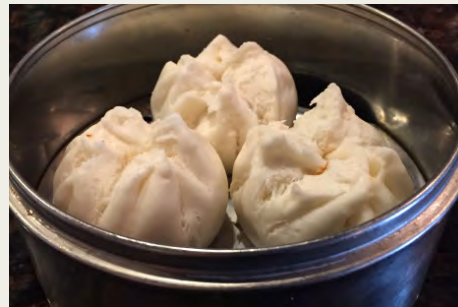
叉燒包 Steamed BBQ Pork Buns (3)