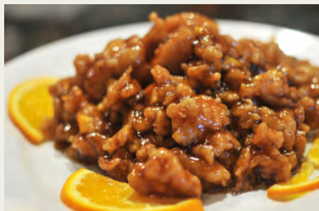
橙皮雞 Orange Chicken $11.98 橙皮牛 Orange Beef $12.98