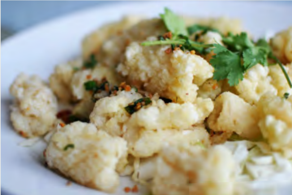
椒鹽魷魚 Salt & Pepper Calamari