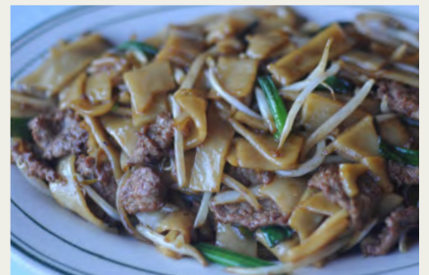
干炒素河 Chow Fun with Vegetable $9.98