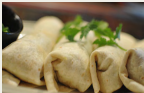
木須雞 / 肉 / 牛 / 蝦 $12.98 Moo Shu Chicken/Pork/Beef/Shrimp 木須菜 Moo Shu Vegetable $11.98