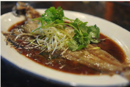
清蒸龍俐魚 Steamed Whole Sole Fish with Ginger & Scallion