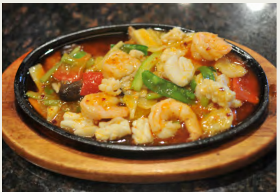
鐵板辣三鮮 🌶️ Jumbo Shrimp, Scallop, Calamari on Hot Plate $16.98