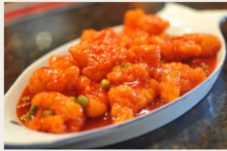
糖醋魚片 Sweet & Sour Sole Fish Filet