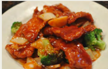
京都肉排 Stripe Pork Beijing Style $11.98 椒鹽肉排 Salt & Pepper Stripe Pork $11.98