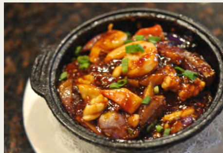
魚香海鮮茄子煲 🌶️ Garlic Seafood & Eggplant in Hot Pot $14.98