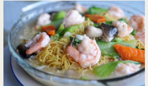
牛肉兩麵黃 Pan-Fry Noodle with Beef $13.98