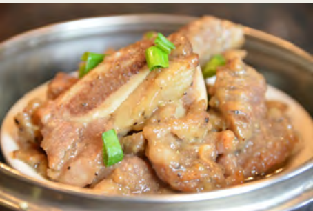
黑椒牛仔骨 Black Pepper Beef Chop