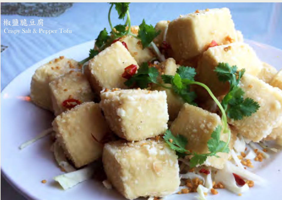
椒鹽脆豆腐 Crispy Salt & Pepper Tofu