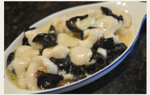
糟溜魚片 Sole Fish Filet with Mushrooms in White Wine Sauce