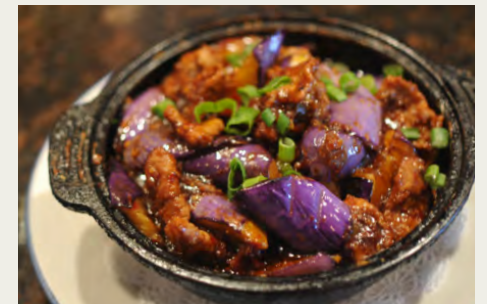
魚香茄子牛肉煲 🌶️ Garlic Beef & Eggplant in Hot Pot $13.98