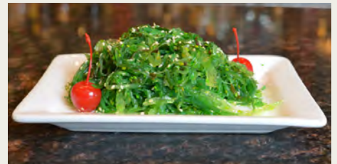
蒜香海帶絲 Seaweed with garlic