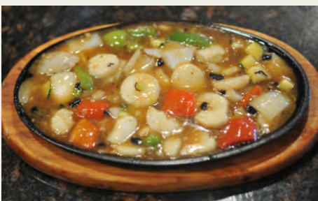
鐵板豆豉帶子 Fresh Scallop with Black Bean Sauce on Hot Plate $18.98