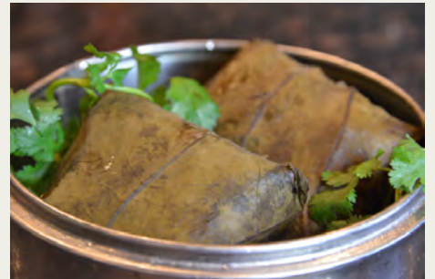
荷香糯米雞 Sticky Rice in Lotus Leaf (2)