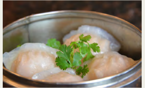
水晶蝦餃 Steamed Shrimp Dumplings (4)