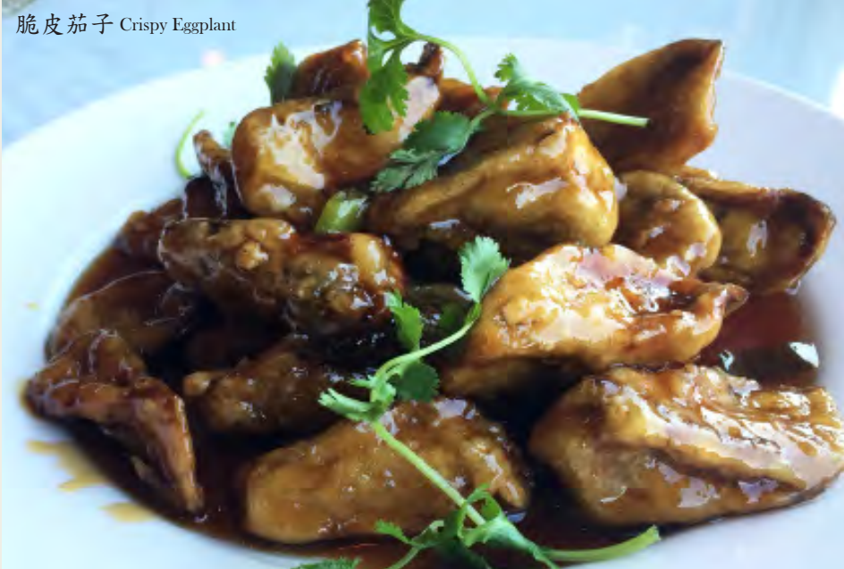
脆皮茄子 Crispy Eggplant