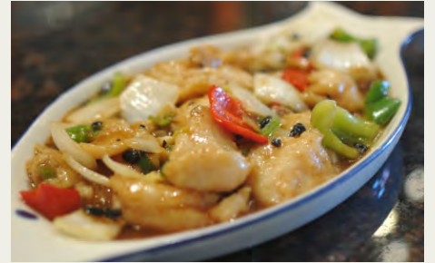
豆鼓魚片 Sole Fish Filet with Vegetable in Black Bean Sauce