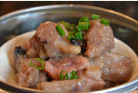
豉汁蒸排骨 Spared Ribs with Black Bean Sauce