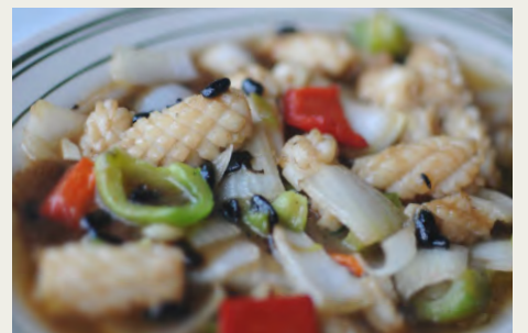
鼓汁鮮魷 Calamari with Black Bean Sauce $14.98 鼓汁蝦球 Shrimp with Black Bean Sauce $14.98