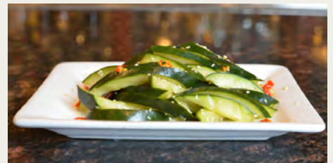
香脆黃瓜 House Cucumber