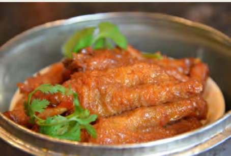
醬皇蒸鳳爪 Steamed Chicken Paws with Black Bean Sauce