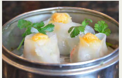
三星海鮮餃 Steamed Seafood Dumplings (3)