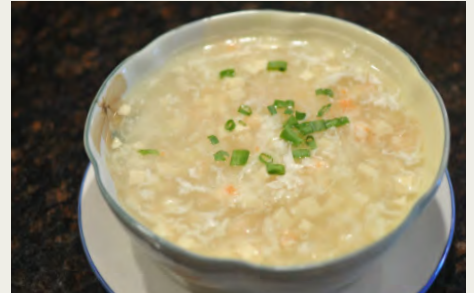
海鮮豆腐羹 Seafood with Tofu Soup