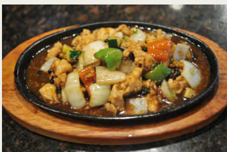
鐵板豆豉雞 Chicken with Black Bean Sauce on Hot Plate $12.98