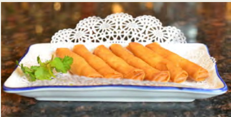
鮮蝦脆春捲 Shrimp Egg Roll