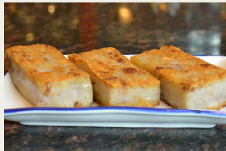
蘿蔔糕 Pan Fried Turimp Cake