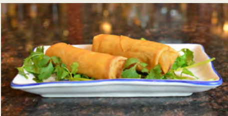
春捲 Vegetable or Pork Egg Roll (2)