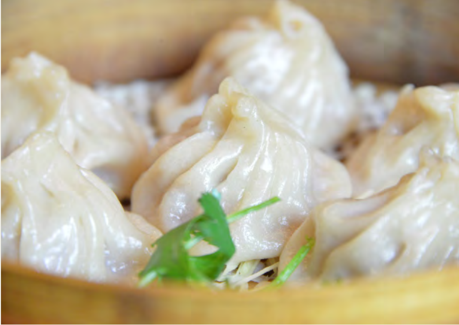
小籠包 Shanghai Juicy Soup Dumplings (6)