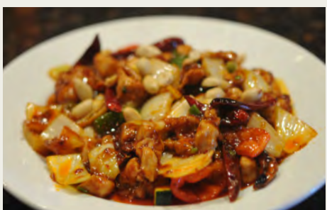
宮保雞 / 牛 🌶️ Kuang Pao Chicken/Beef $11.98/$12.98 腰果雞 / 牛 Cashew Chicken/Beef $11.98/$12.98