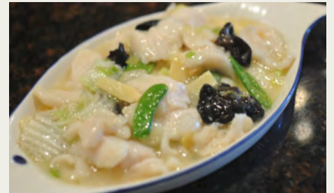
鮮溜魚片 Sole Fish Filet with Vegetable